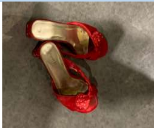
Dorothy's Red Shows